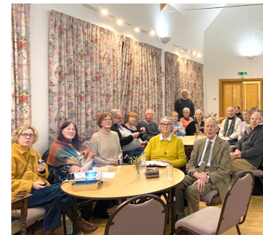
CHRIST THE KING SING

Annual services of Remembrance and Harvest are offered at both churches as well as Patronal Festivals. These events attract the wider community and are frequently attended by our younger uniformed organisations. Within our church buildings dedicated teams of volunteers use their talents to produce floral arrangements as a means of enriching our places of worship throughout the year and for parish life events.