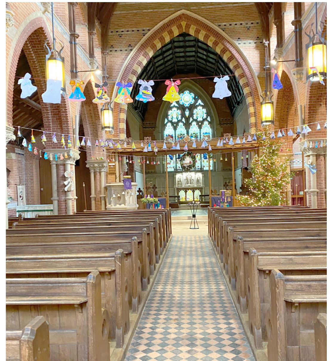
DECORATING FOR CHRISTMAS BY LOCAL PRIMARY SCHOOL