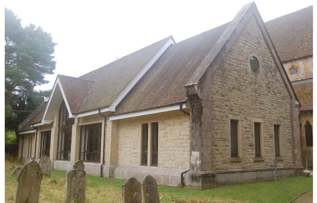
SHEDFIELD STUDY CENTRE

Our church grounds surrounding our buildings are providing excellent ways of reaching out to people beyond our usual congregations. They are used and worked in by a wide range of people both within and beyond our local communities. Our volunteers work regularly within them and are proud of what