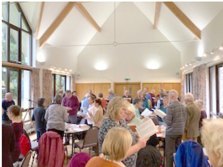
BRINGING OUR COMMUNITIES TOGETHER IN WORSHIP AND FELLOWSHIP AT CAFÉ CHURCH

Do please consider joining and leading us in this next stage of our journey as we seek to grow and spread the word of God.