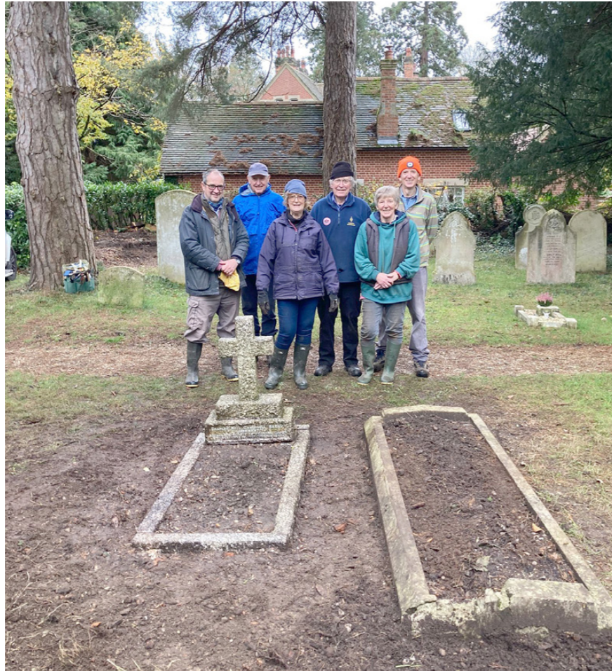
ST JOHN THE BAPTIST CHURCHYARD TEAM

The Study Centre at St John the Baptist provides an ideal meeting place for groups and organisations. In addition to existing groups, a recently formed Mindful Stitch group meets once a month bringing together members of the church and the wider community. There is scope for greater use of this resource as well as the Church Room at St Nicholas and for the development of events that might appeal across the generations, enabling our outreach activities to be expanded.