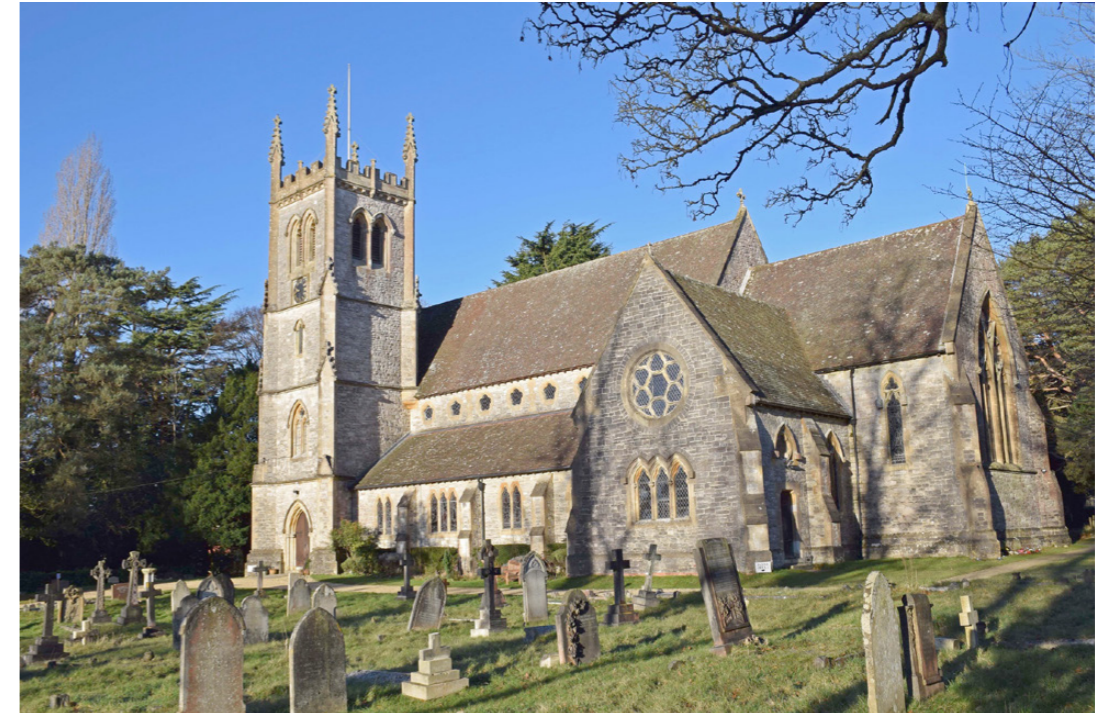
ST JOHN THE BAPTIST, SHEDFIELD

Our two semi-rural parishes are in the beautiful county of Hampshire, in the Meon Valley on the edge of the South Downs National Park and equidistant between the cities of Portsmouth, Southampton and Winchester. The Benefice was created in 2007 consisting of two neighbouring churches that lie approximately 1.5 miles apart. Each church has an independent PCC, but they meet on a couple of occasions each year. Background information about each parish can be found in Appendix 1 and other data associated with the life of the churches in Appendix 2.