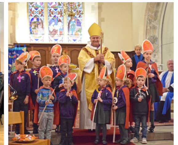
ST NICHOLAS, PATRONAL FESTIVAL

We are not afraid to try something new; the 'Christ the King Sing', an opportunity for praise and fellowship as an evening event was adopted in recent years and has been very well received. The new Pop-Up Nativity in 2023 was a great success and enjoyed by adults and children alike.