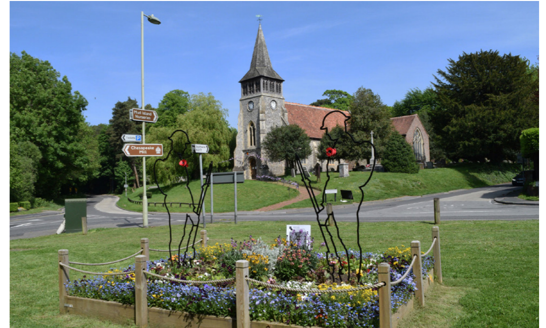
ST NICHOLAS, WICKHAM