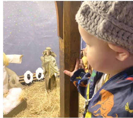
NATIVITY, ST JOHN THE BAPTIST