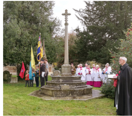
REMEMBRANCE, ST NICHOLAS

In April 2024 the first cohort of lay worship leaders for the deanery were commissioned by the Archdeacon in St Nicholas, Wickham. Currently there are five within the benefice; four from Wickham and one from Shedfield. Having completed eight modules of training over four Saturday mornings from November to January, they are now authorised to lead worship within the Bishops Waltham Deanery at the specific invitation of the parish incumbent or Area Dean. To date they have led worship at many non-eucharistic Sunday morning services, as well as evensong and Holy Week compline. Their enthusiasm for the role is evident from the photograph and they have been accepted warmly by the ministry team and congregations.