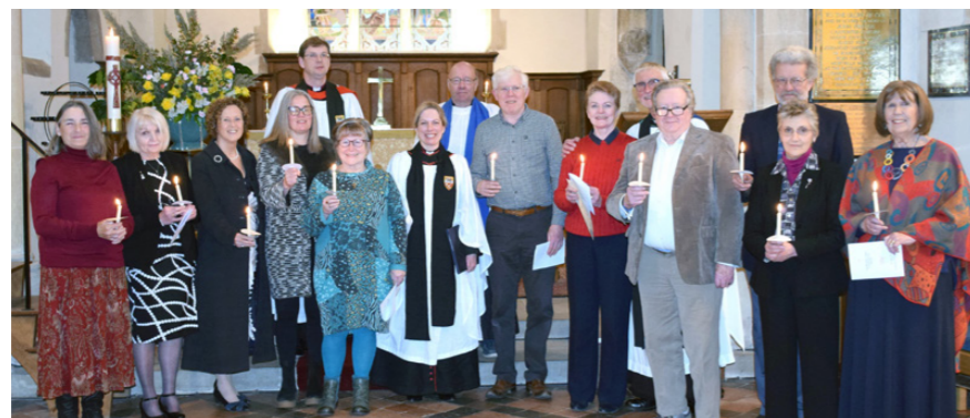
COMMISSIONING OF LAY WORSHIP TEAM MEMBERS

In April 2024 the first cohort of lay worship leaders for the deanery were commissioned by the Archdeacon in St Nicholas, Wickham. Currently there are five within the benefice; four from Wickham and one from Shedfield. Having completed eight modules of training over four Saturday mornings from November to January, they are now authorised to lead worship within the Bishops Waltham Deanery at the specific invitation of the parish incumbent or Area Dean. To date they have led worship at many non-eucharistic Sunday morning services, as well as evensong and Holy Week compline. Their enthusiasm for the role is evident from the photograph and they have been accepted warmly by the ministry team and congregations.