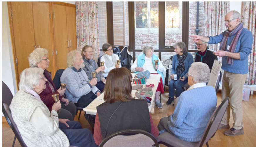
TUESDAY AT TEN

Our church community is generally older, but in many respects young at heart and recognises the need to move forwards whilst still retaining some of the familiarity of traditional worship. Support outside of services has been provided through a long established 'Parish Lunch' held in the Study Centre for the over 60s. This is regularly attended by around fifty people including helpers. A 'Tuesday at Ten' group has been established to predominantly support our older communities. This was set up to meet the needs of people in need of company along the principles of "love thy neighbour" (Appendix 5).