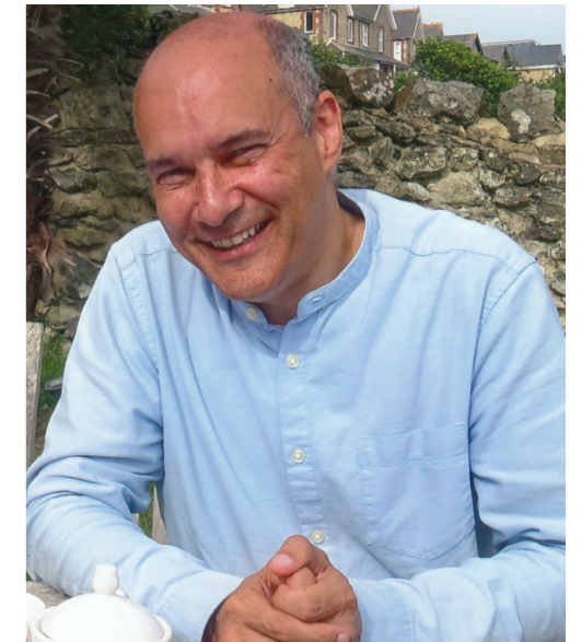
THE VEN STEPHEN DAUGHTERY, ARCHDEACON OF THE ISLE OF WIGHT

its closest village neighbours Northwood and Gurnard. The vision for Cowes is for one united Cluster of four distinct parishes, with multiple expressions, locations, worship styles, ministries and missions across the town and villages, to proclaim the gospel afresh to every generation. Each of the four churches involved is committed to working together in a seamless way, which aims to enhance and develop the present base of traditional Anglican worship, expanding its scope to include regular charismatic and contemplative opportunities, while also being generous and welcoming to new and generous ways of being Church.