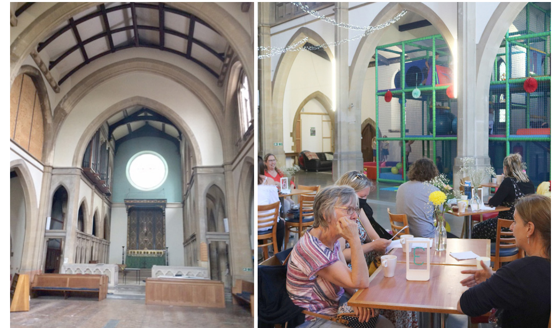
REPAIRS TO ST MARGARET'S CHURCH, SOUTHSEA, BEFORE AND AFTER