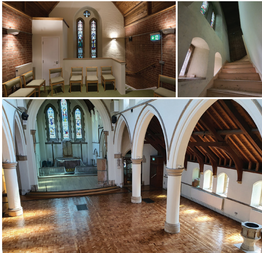
INTERNAL REORDERING AT ST MARY'S CHURCH , LISS