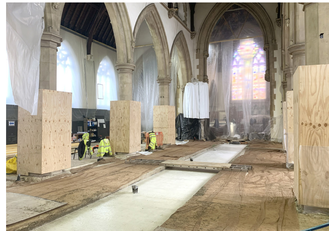
REPAIR WORK CURRENTLY BEING UNDERTAKEN AT NEWPORT MINSTER

The Diocesan Chancellor will act as the independent Judge of the Diocesan Consistory Court with jurisdiction as laid down in S7 of the Ecclesiastical Jurisdiction and Care of Churches Measure 2018. As such they will determine proceedings which relate to the use of and reordering of church buildings and land, applications for grave reservations and exhumations and other legal matters as specified in the Measure. They will work closely with the Diocesan Registry, the Archdeacons and the Diocesan Advisory Committee.