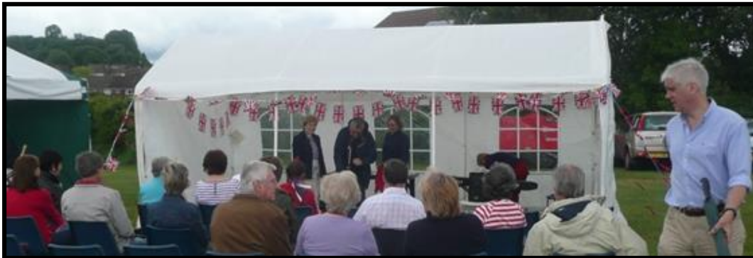
Service in the Meadow – Queen’s Jubilee