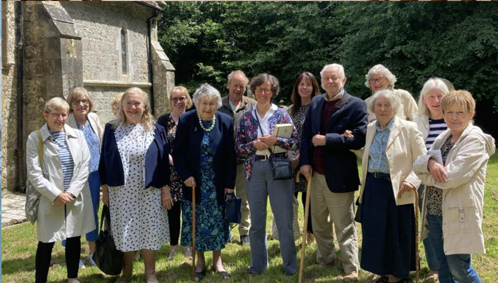
MEMBERS OF THE CONGREGATIONS