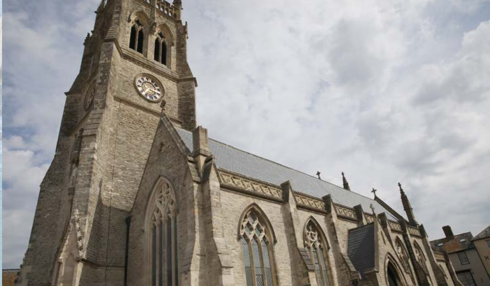
ST MARY'S, ST JOHN'S AND NEWPORT MINSTER