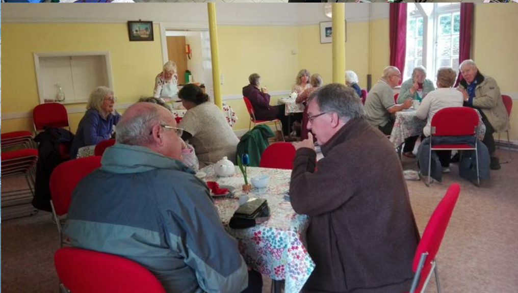
COMMUNITY EVENTS IN CHURCH HALLS