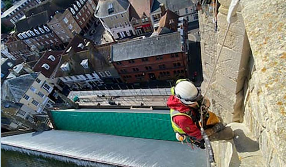
ST OLAVE'S, ST NICHOLAS-IN-CASTRO AND MINSTER RESTORATION WORK