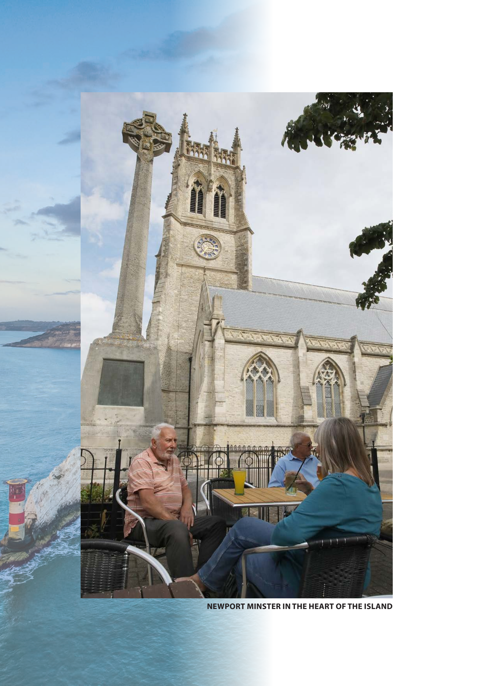
NEWPORT MINSTER IN THE HEART OF THE ISLAND