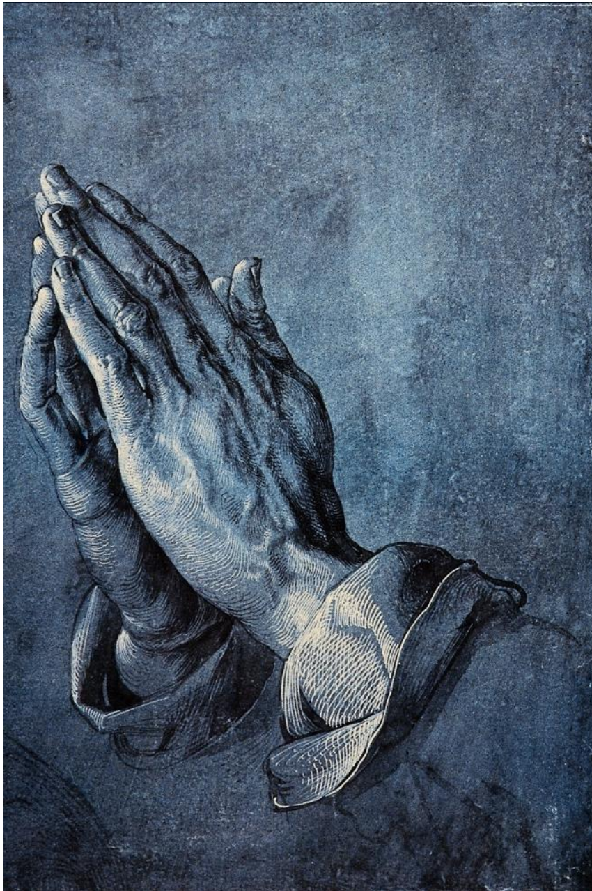
Praying Hands – Albrecht Durer, 1508