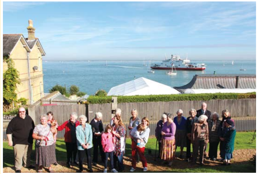
Above: Some Holy Trinity members in the churchyard.

First and foremost is the need to ensure that the light of the Holy Spirit continues to burn at Holy Trinity. We feel God has created a small but intense flame here, but that none of us who tend it are getting any younger, and although parishioners are broadly well-disposed towards Holy Trinity, there is in the parish a lack of zeal which needs firing up. With only 54 people on the electoral roll, the core congregation is small and its loyal members diverse in outlook and standing but very active and well-integrated within the community. Holy Trinity has so many blessings in the form of its prominence on the waterfront, the beauty of its interior which will soon be visible from outside through the new glass doors, its strong bank balance and the support and encouragement it receives from the Royal Yacht Squadron: although parishioners display many Christian virtues and one does not have to go to church every Sunday to be a Christian, the plain fact remains that if nobody goes to church, the church will die.