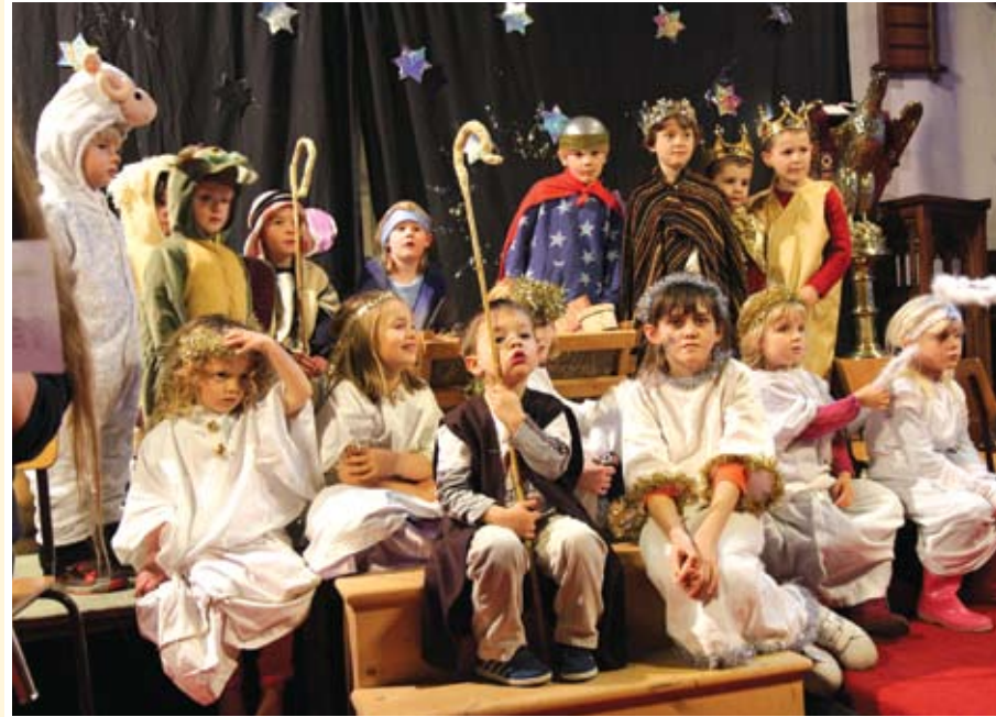
Above: Children's nativity.

1030 Joint Celebration of Holy Communion with St. Mary's alternating between the two churches.