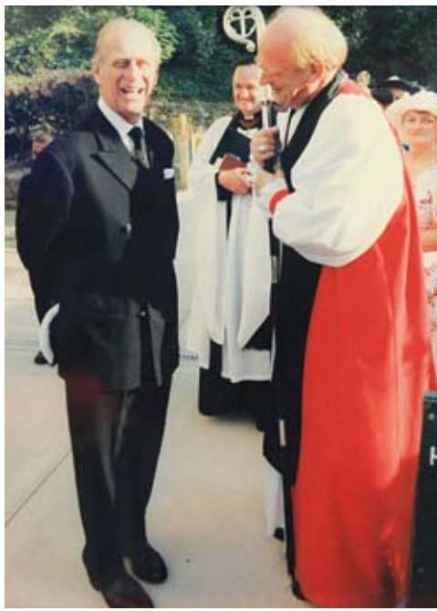
Above: H.R.H. Prince Philip is a regular visitor to Holy Trinity.

Throughout the year our very active Social Committee meet to organise fund-raising activities including the Summer and Christmas Fairs. For weeks before these events, members of the church are baking delicious cakes to sell. Superb meals are cooked by Holy Trinity members in the kitchen at the church and served in the church room adjoining it. At the Summer Fair we run a Dog Show, and Father Christmas makes an appearance at Christmas. Pancakes are served on Shrove Tuesday, monthly lunches in aid of charity are held and a major event in the autumn is the Harvest Supper with an auction for charity of harvest produce.