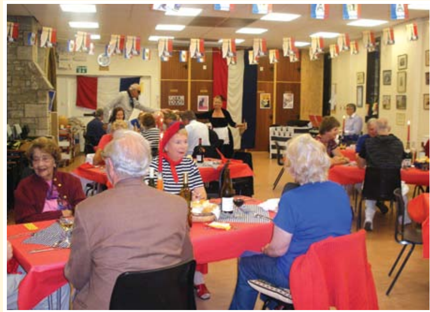
Above: St. Mary's Parish Room.

The Parish Room is used to run 'Messy Church' for the children on the 4th Sunday of the month, at the same time as the main service. It is in regular use by the wider community, Adult Arts and Craft Group, Children's Art and Craft Group, Rainbows, Birthday Parties, and Wakes, University of the Third Age (U3A), Cowes-Deauville Twinning Association, and for the first time in 2014 the church and parish room will be used for parts of the Isle of Wight Literary Festival.