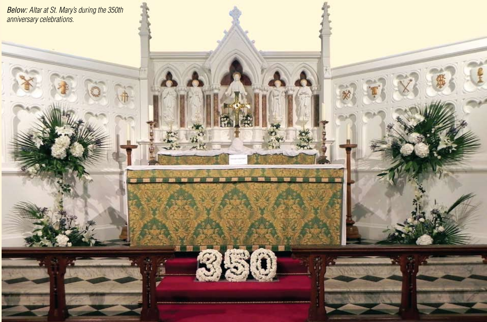
Below: Altar at St. Mary's during the 350th anniversary celebrations.

The Annual Parish Share for St. Mary's in 2013 was £39,340, the highest in the West Wight Deanery. The trend of the past three years has been for the parish to continue to pay its way with regard to the day-to-day bills, and try to pay as much of the Parish Share as it is able. Expenditure has been reduced as much as possible: however with ever-increasing costs and Parish Share, the parish has been unable to catch up on its shortfall to the diocese, following its major building work in 2005/6 which saw all of its reserves used up.