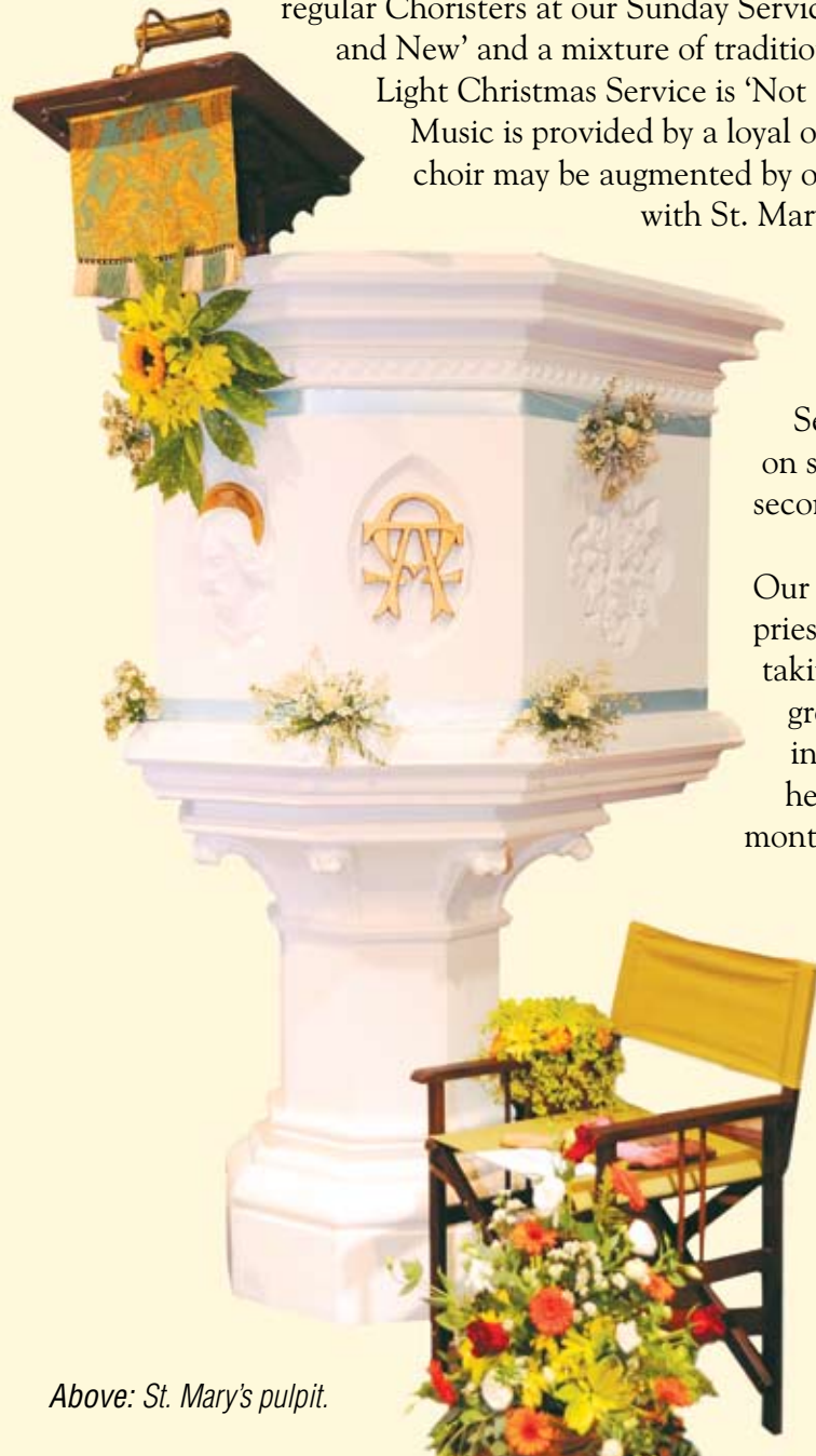
Above: St. Mary's pulpit.

At present Common Worship Order One is used. Music tradition is important at St. Mary's. We currently have 10 regular Choristers at our Sunday Services, singing an Anthem at all but one service per month. We use 'Hymns Old and New' and a mixture of traditional and modern hymns sung to our beautiful Father Willis organ, and our Candle Light Christmas Service is 'Not to be Missed', the atmosphere and acoustics are appreciated by our many visitors. Music is provided by a loyal organist supporting the choir. On special occasions (eg. Weddings, funerals), the choir may be augmented by other singers, and for certain services Holy Trinity's choir is invited to combine with St. Mary's.