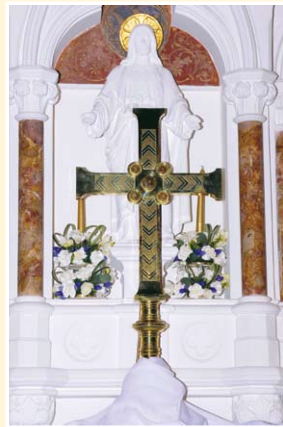
Above: Altar cross at St. Mary's.

The Sunday attendance at 8 am is normally around 10 - 14 and at 11 am between 30 and 45. Wednesday morning attendance is usually between 11 and 16 (more in Lent). On special days - notably Christmas, Easter, Remembrance Sunday and during Cowes Week - extra services are held.