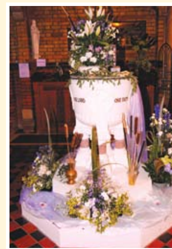
Flowers at St Mary's.