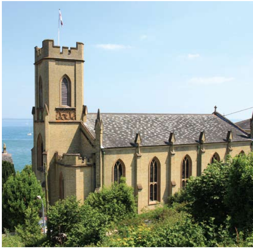
Above: Holy Trinity Church.