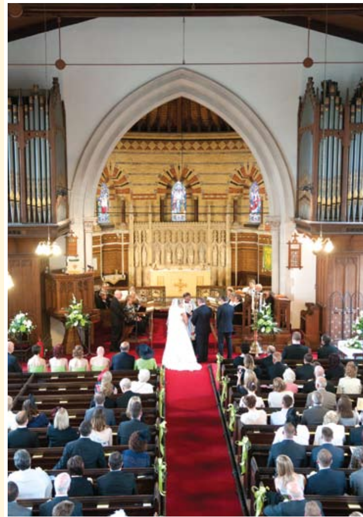
Above: wedding at Holy Trinity.

N.B. Holy Trinity has always paid its full Parish Share.