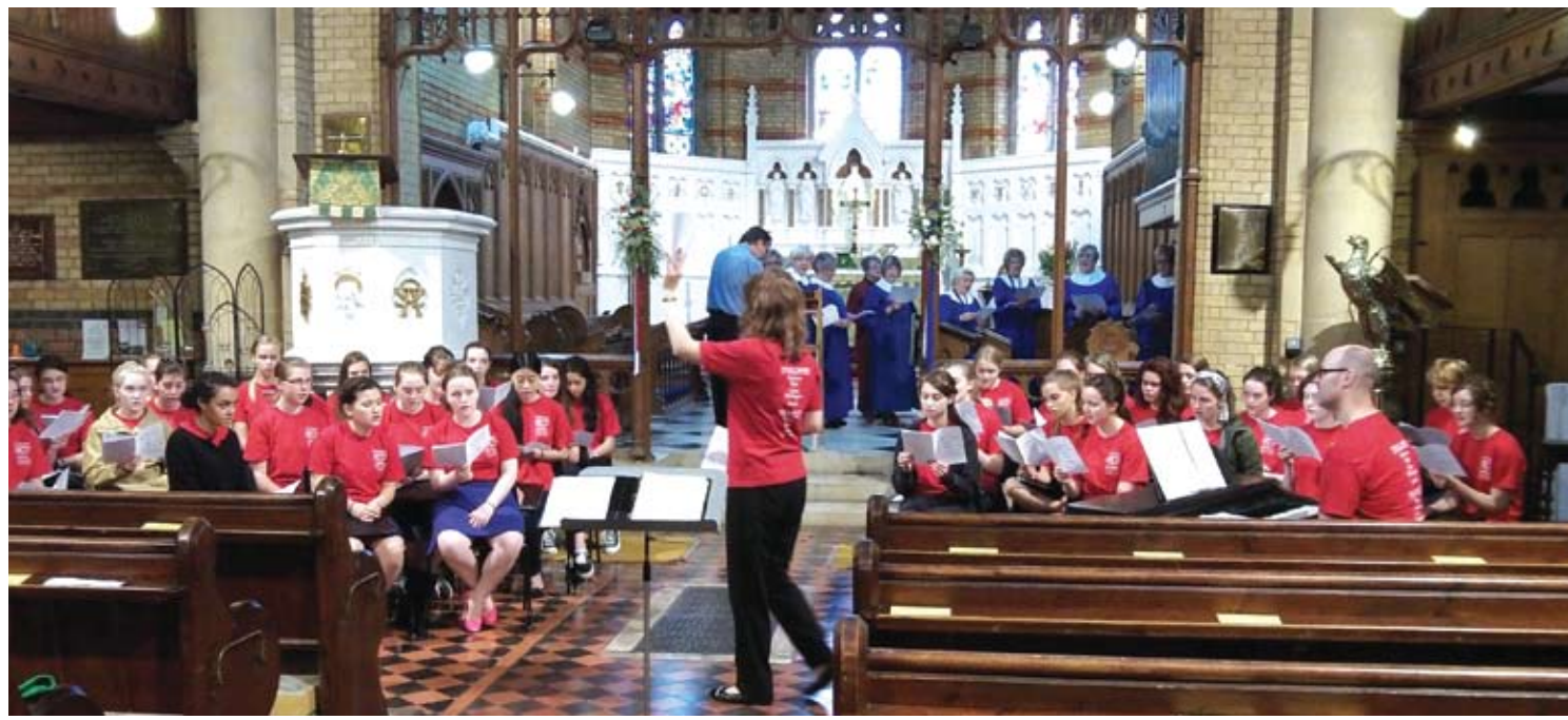
Above: Concert at St Mary's.

The very active Flower Arranging Group works on a Rota to decorate the church, as well as providing flowers for weddings and funerals.