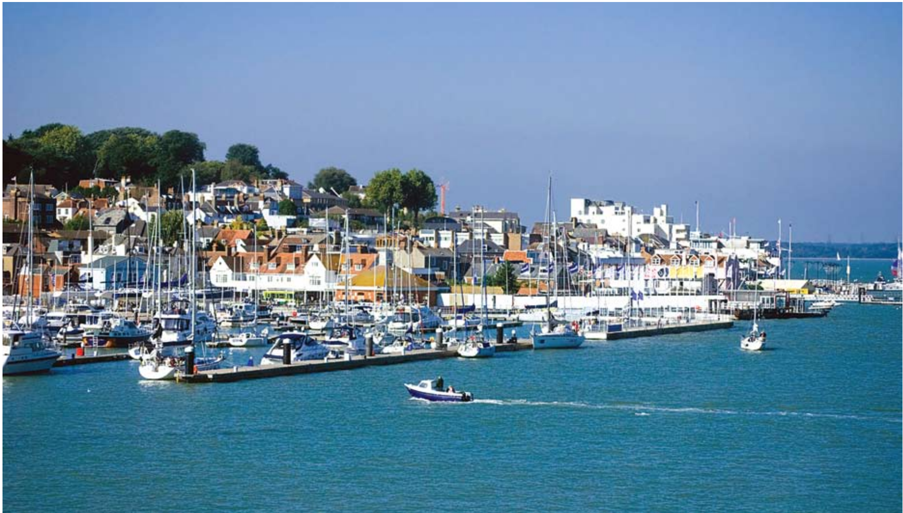
Above: The harbour at West Cowes looking towards the Solent.