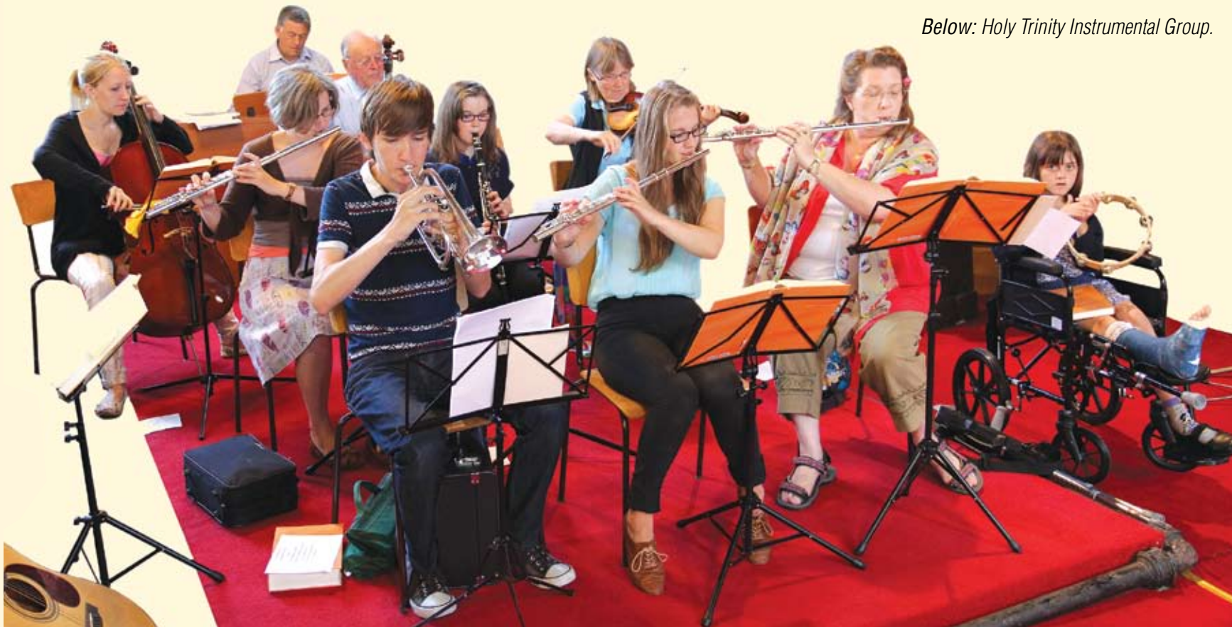
Below: Holy Trinity Instrumental Group.

Cowes Week, the famous annual Regatta Week in August each year, is of course the high point of Cowes' summer. The town is packed with international sailors and crowds are shoulder-to-shoulder in the High Street. During the Week Holy Trinity stages an exhibition and is manned and kept open daily for refreshments and lunches by our very dedicated and highly competent catering team and their assistants. With its magnificent viewing point for the racing and Friday fireworks it is a hugely popular venue and used to the best possible advantage; in recent years a barbecue has been held before the Fireworks. Two special seafaring services are held on the Sunday, which the Mayor, local town councillors and dignitaries attend. The Bishop usually preaches at at least one of them, the Sea Cadets form a guard of honour and lessons are read by representatives from Trinity House, local yachting organisations and clubs, seafaring charities, etc. In the past Royalty has attended these two services, and at both the church is packed.