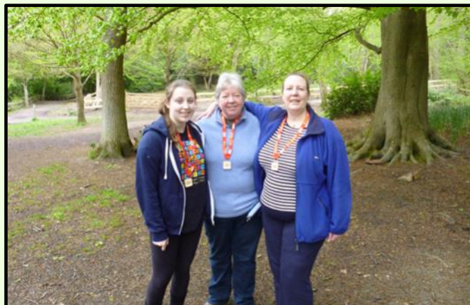
Christian Aid Walk 2013

We take part in the fund raising activities for Christian Aid week.