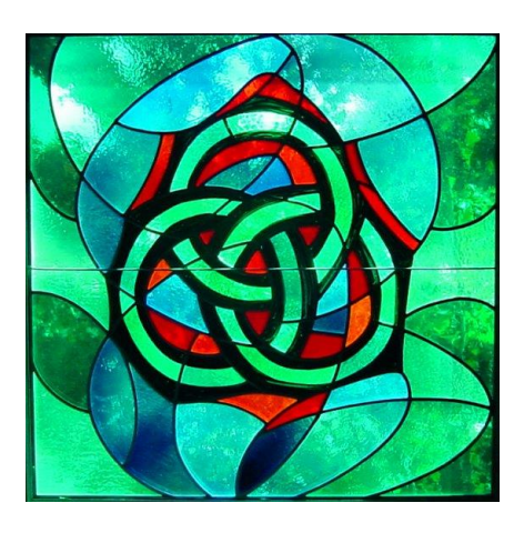
'May the grace of our Lord Jesus Christ and the love of God and the fellowship of the Holy Spirit be with you all'