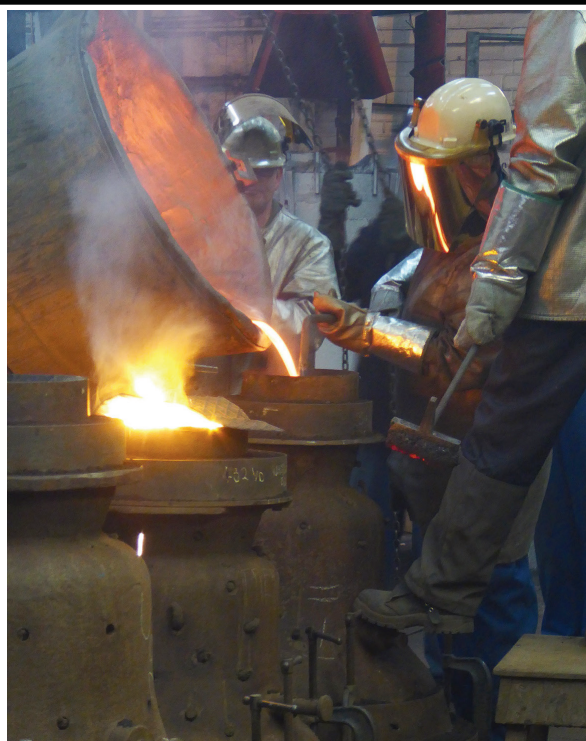
The new bells for Brighstone are cast