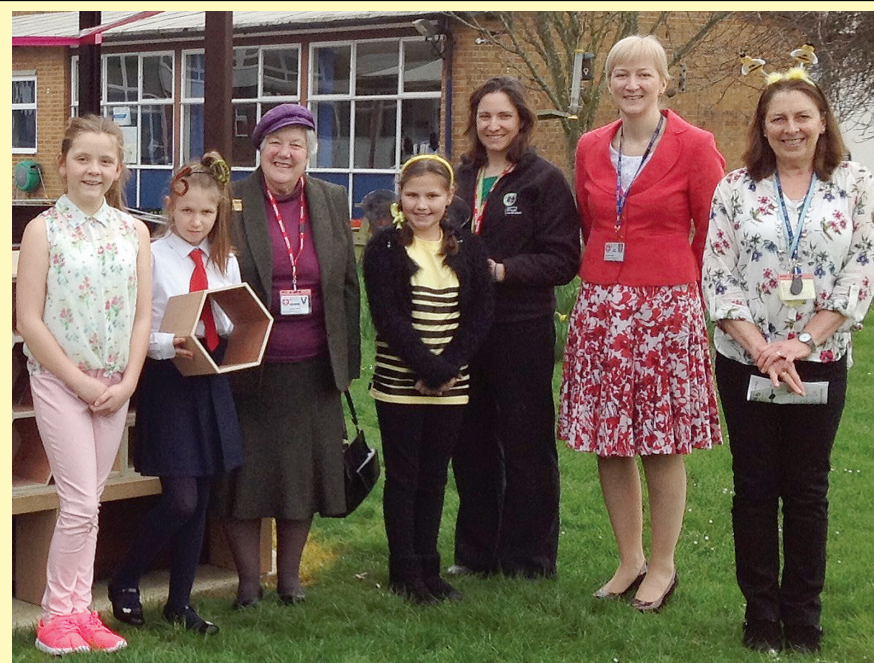
The Mayor of Havant at St Alban's School to see the new bee habitat

As well as improving their own grounds, pupils also planted an area of the Hermitage Stream in Havant with