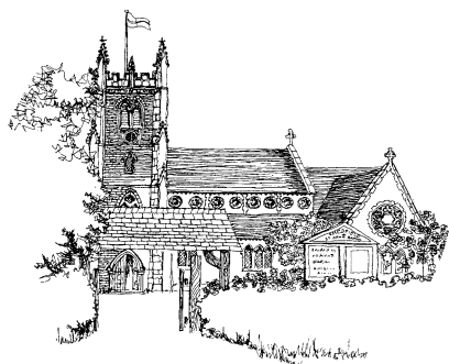
St John the Baptist, Shedfield

'Drawing people closer to God and to each other' 'Jesus... the way, the truth and the life...' (John 14:6)