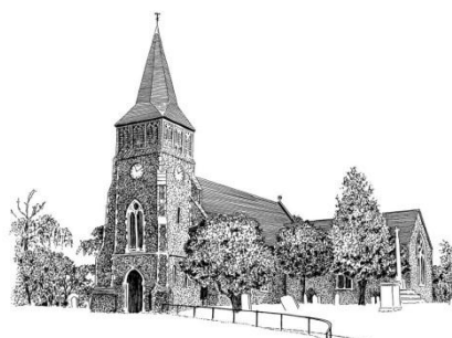
St Nicholas, Wickham