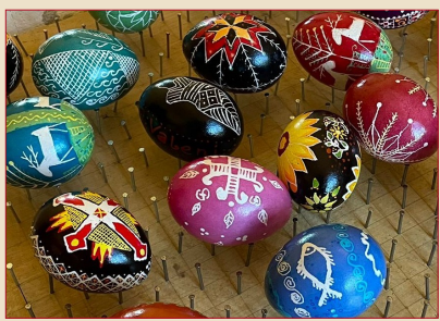
"Exceeded my expectations!"