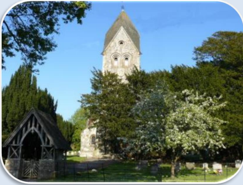
ST PETER & ST PAUL, HAWKLEY