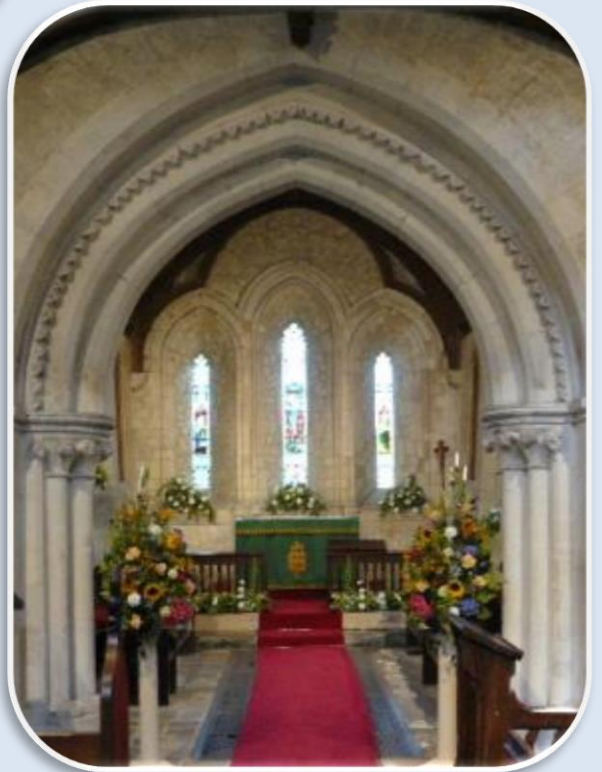
HOLY ROOD, EMPHOTT