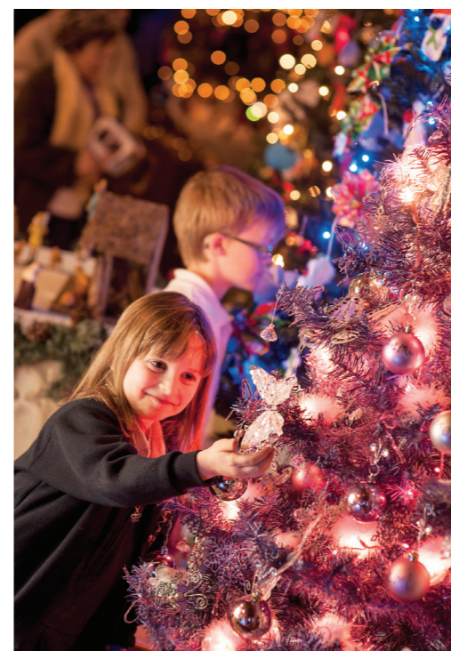
Brighstone Christmas Tree Festival

Thousands of visitors will also visit Christmas tree festivals in our churches, at which hundreds of trees are decorated and illuminated, often by local community groups. The Brighstone Christmas Tree Festival is the largest on the Isle of Wight. Seven venues in the village throw open their doors for visitors to see the stunning displays of Christmas trees and enjoy entertainment from December 5-9. The concerts continue until December 15. Full details are on www.bxtf.org