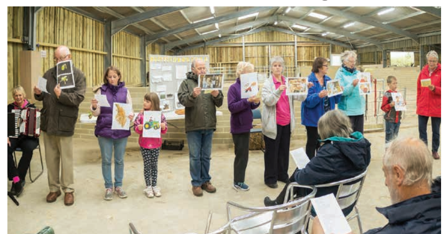
The story of bread explained at the Isle of Wight Donkey Sanctuary