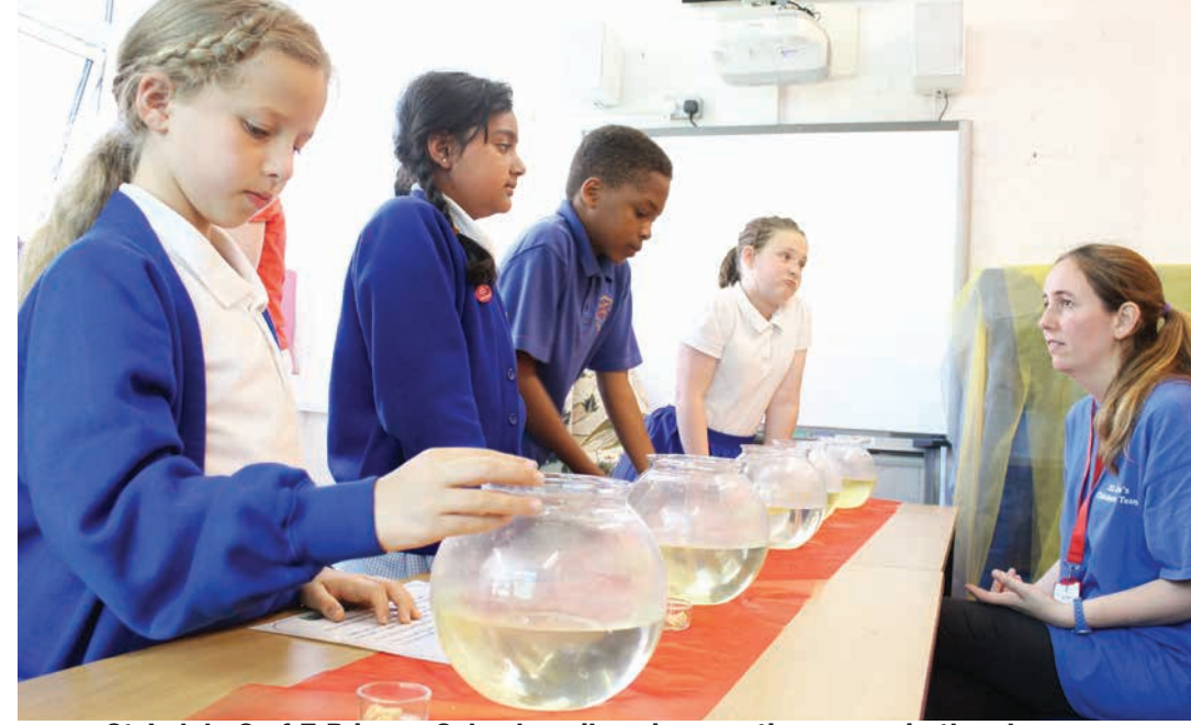
St Jude's C of E Primary School pupils enjoy creative prayer in the classroom

The Family Tree activity involved them writing prayers on hand-shaped pieces of paper, which were attached to a papermaché tree. Fizzy Forgiveness involved dissolving a tablet into a bowl, representing the