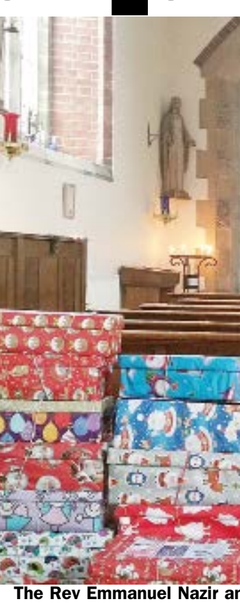
on December 8 and continues on December 9-11.

see page 15 or www.bxtf.org.uk. The Alverstoke Christmas Tree