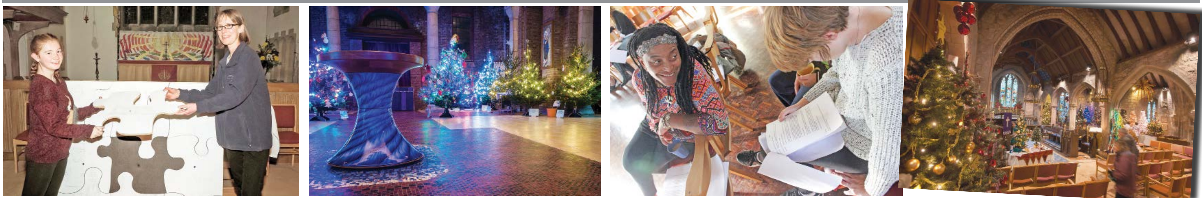
prepare the jigsaw Nativity at Farlington; the Christmas tree festival at St Cuthbert's Church, Copnor; rehearsals for the Leigh Park and Warren Park Community Nativity; and the Christmas tree festival at St Mary's Church, Brighstone