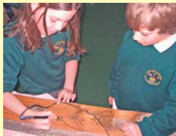
Pupils from Hook-with-Warsash Primary use the wood-burning pen

Some pupils even had the chance to use a special wood-burning pen to create their own designs on a totem pole