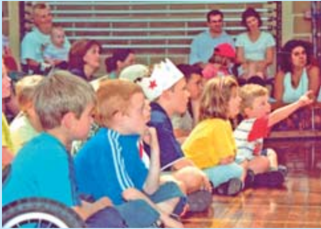
Children watch puppets at a previous deanery day

Followed by lunch and chance to meet her. Contact: Jo Findlay (023-9287 3277).