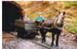
Blackie's last day at work, at Cam Cornel Colliery, Severn Sisters, Neath.

Forest Uchaf Horse & Pony Centre, Penycoedcae, Pontypridd CF37 1PS Registered Charity No 1002933