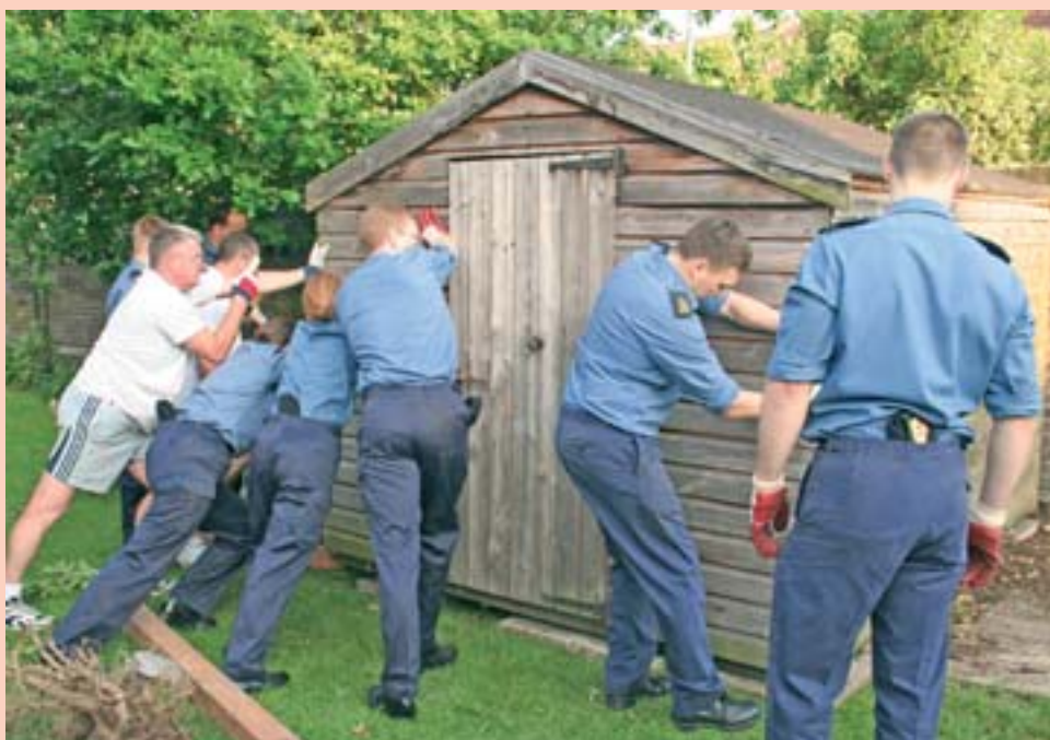
Officers and ratings from the Royal Navy move one of the sheds at the Church of the Ascension in North End

OFFICERS and ratings from the Royal Navy helped worshippers at the Church of the Ascension in North End move four sheds and demolish a fifth – the first stage in a project to transform the church.