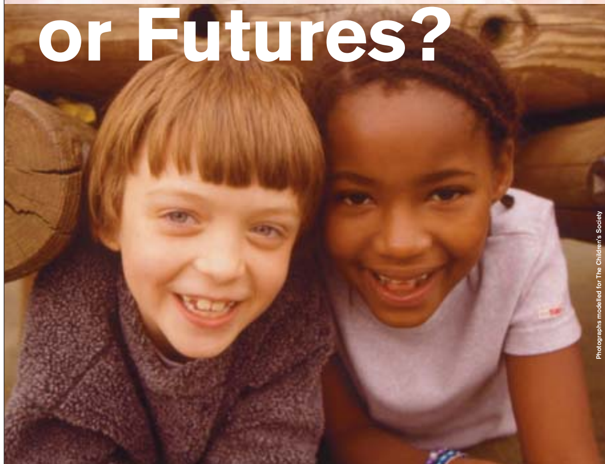
Photographs modelled for The Children's Society

The Children's Society has recently produced a new Donations In Memory pack, together with a supporting website called 'Flowers or Futures'.